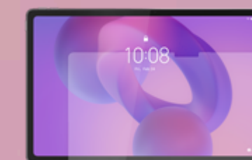
Lenovo Idea Tab Plus Glass Screen Protector ZG38C07403