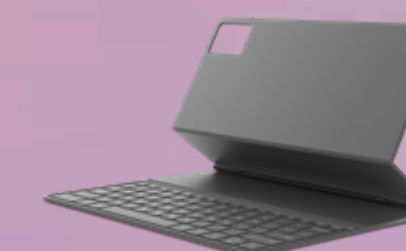
Lenovo Folio Keyboard For Idea Tab Plus ZG38C07504

Please click here to view the full list of accessories.