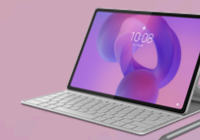
Lenovo Folio Keyboard For Idea Tab Plus ZG38C07505